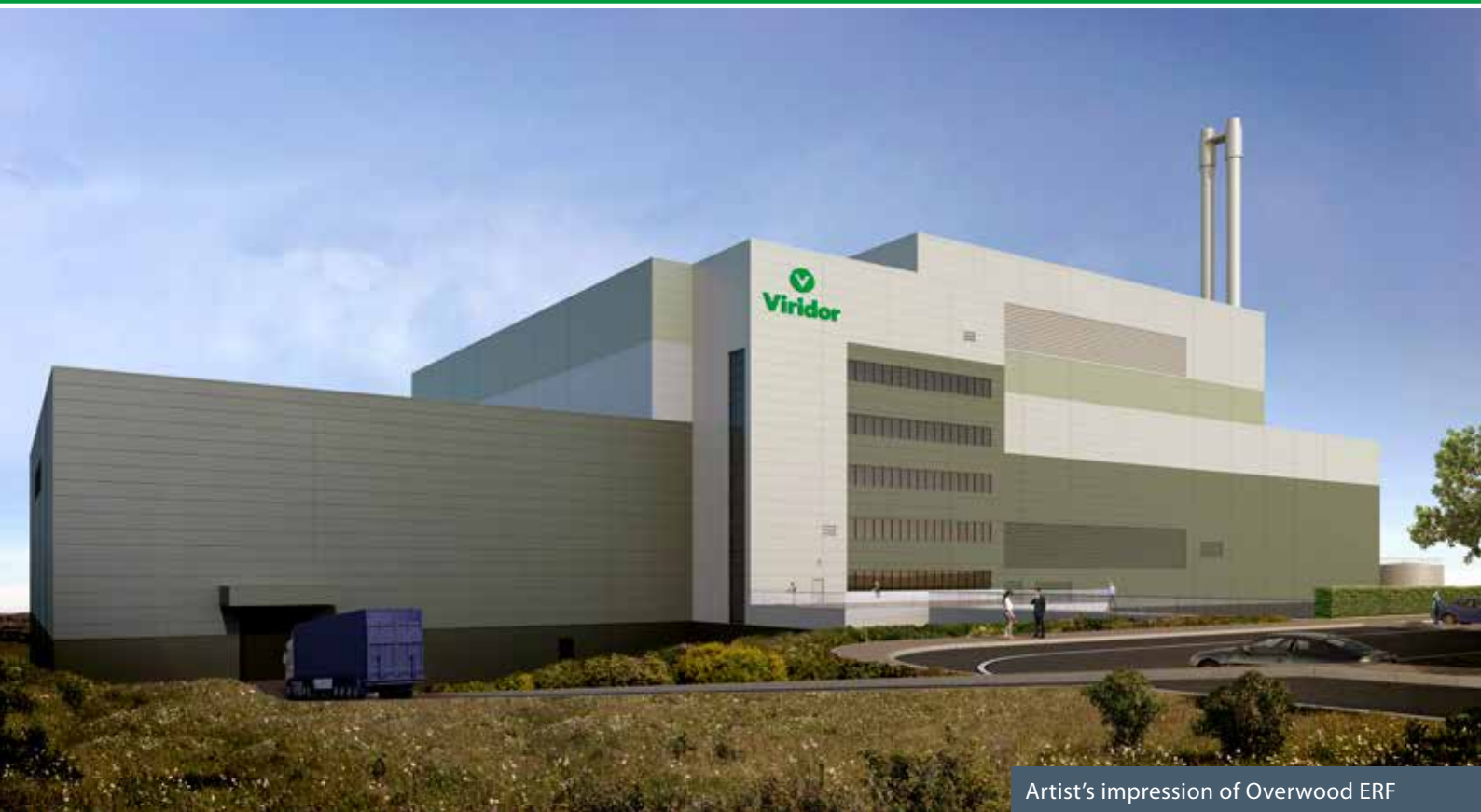
Artist's impression of Overwood ERF